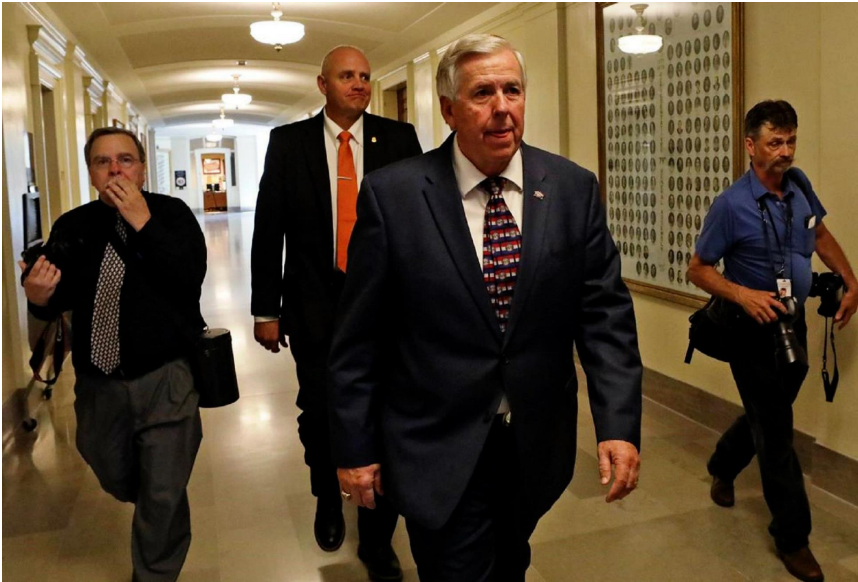
Gov. Mike Parson leaves the House chambers after addressing a joint session of the legislature on Monday, June 11, 2018, at the capitol building in Jefferson City.